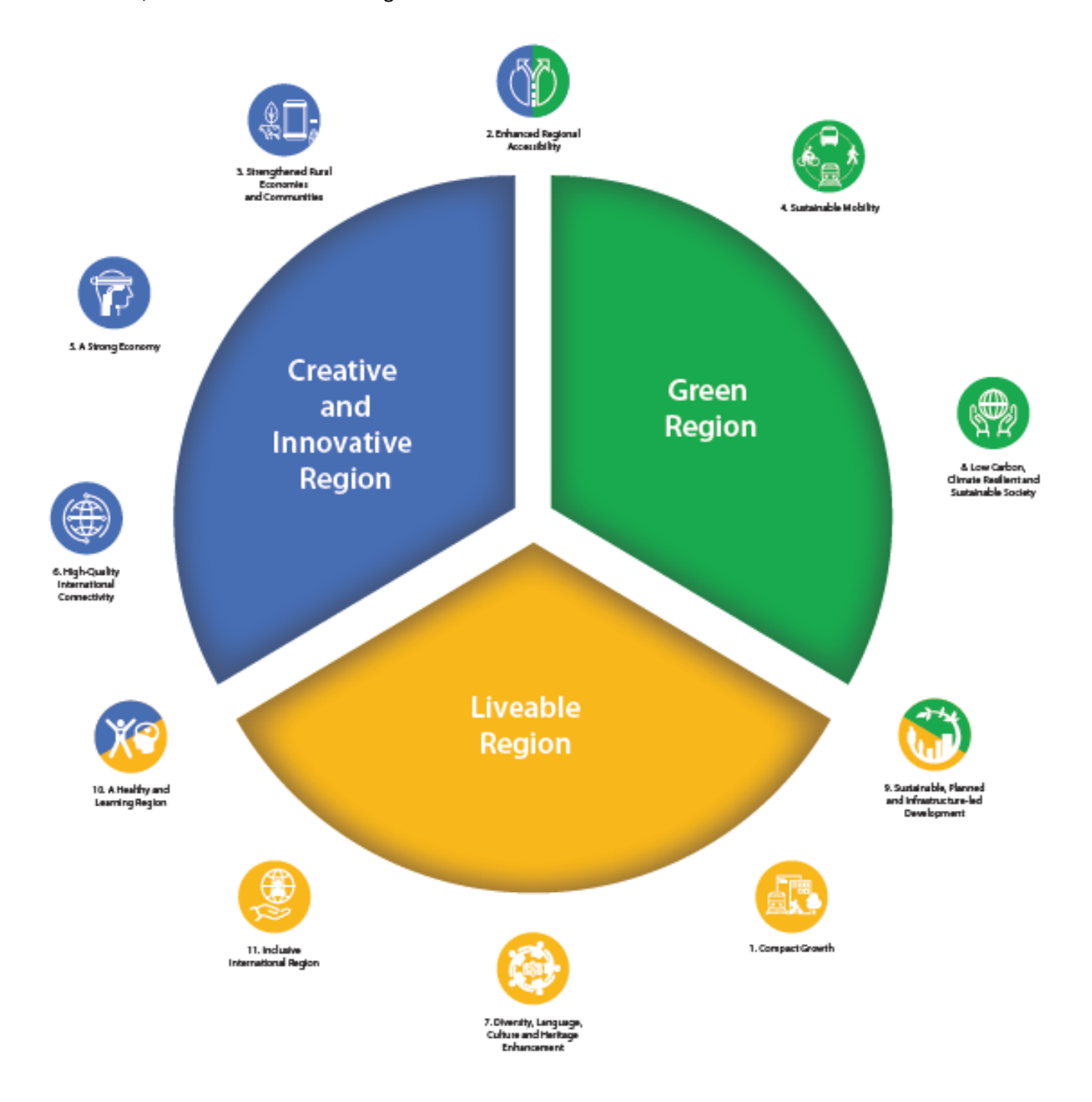
Figure 1: RSES Vision and Strategy Statements

The vision of our RSES is for the Southern Region to become one of Europe's most Creative and Innovative , Greenest and Liveable regions.