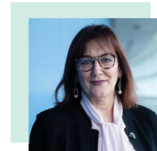
Ms Dubravka Šuica, Vice-President of the European Commission in charge of Democracy and Demography

It reports on a regular basis to the Joint Presidency.