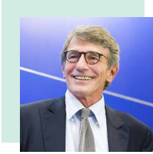
David Sassoli, President of the European Parliament

The Conference is placed under the authority of the three institutions, represented by