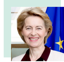
Ursula von der Leyen, President of the European Commission