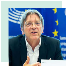
Mr Guy Verhofstadt, Member of the European Parliament

The Joint Presidency is supported by an Executive Board , which is co-chaired by the three institutions.